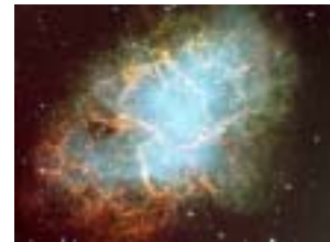
The Crab Nebula