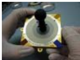
The sundial