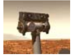
The Pancam