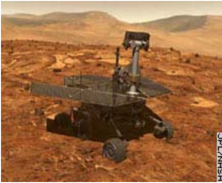
Mars Rover (Simulation)