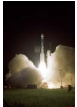
July 3 rd , 2:47 a.m.

When it is 60 degrees up, a crack and a roar and thunder washes over everyone and the rocket just keeps charging straight up. Red fire underneath. After all this worrying and waiting, it is happening so fast. Too fast. Part of me wants it to come back. Away and up it is rising and moving to the northeast over the ocean now. I am crying. The rocket still thundering. The path takes the rocket through a tiny wispy cloud that is momentarily lit up as it slips through and beyond. When the solid rocket boosters burn out we see them jettisoned. Four tiny orange glowing lights falling from the now tiny orange fire of the main engine. It keeps going, the orange light becoming smaller and smaller. Off into what we now realize is a very large amount of space above the earth. CONTOUR is gone from us. Gone from the clean rooms and the caring hands that built each strut and circuit. Within minutes it will clear the atmosphere and we know that the protective nosepiece will be jettisoned and the tiny little spaceship will be hurtling through space above a darkened earth at incredible speeds. All this I imagine because it is now the tiniest little orange